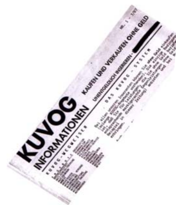
KUVOG (Buy and Sell without Money), an initiative in Hannover, 1987, which did not take off the ground.

In the late seventies and early eighties people rediscovered the informal economy. Homework and do-it-yourself, also moonlighting and the new generation of self-employed working in newly established co-operatives. Many of the ideas discussed at that time provided the ground for the development of exchange systems.