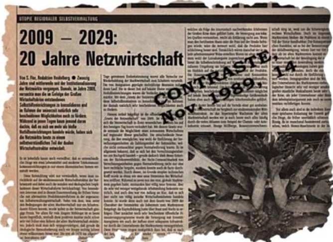
S. Flor's scenario of the dual economy of the year 2029.